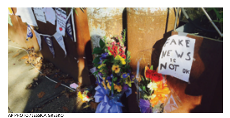
Conspiracism's Path to Violence

To some people immersed in conspiracism, violence can come to seem like the only appropriate response. The opposition, believed to be treacherous, must be thwarted by any means.