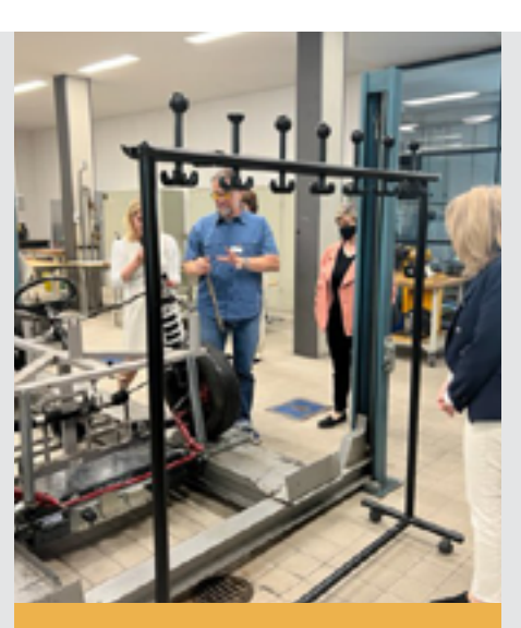
AFT President Randi Weingarten and a delegation of AFT leaders tour a German vocational education and training program focused on automotive technology.

Today, we can see everywhere the challenges we face as a nation and the scale of the work we need to do. We have young people desperate to take action on issues ranging from climate change to broadbased economic prosperity in which no one gets left behind. But they need the tools. To fight climate change, we need skilled